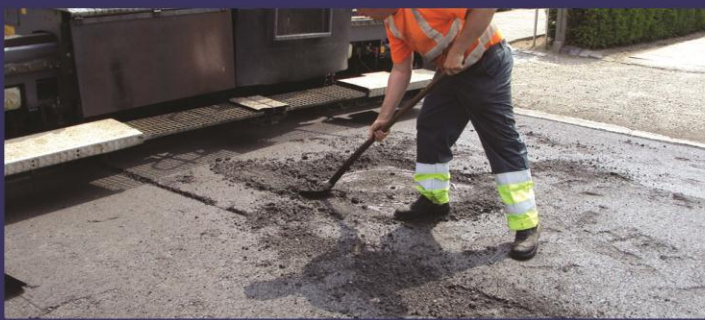
• cold application construction