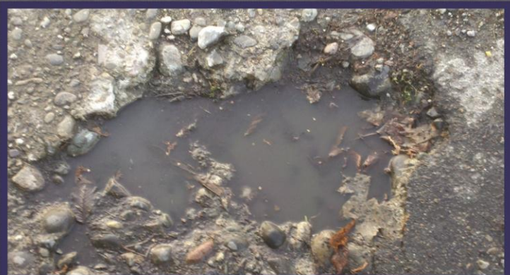
• water-filled pothole repair