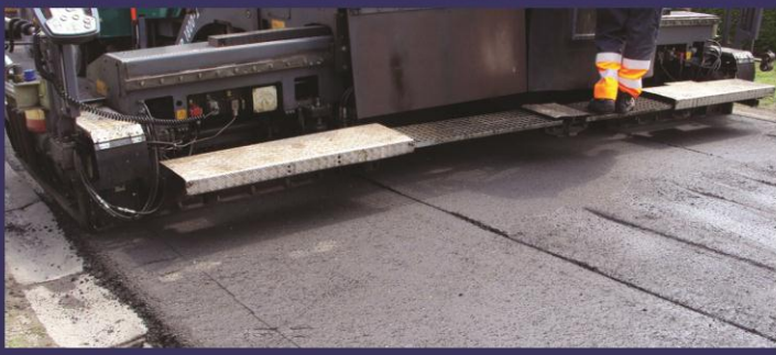
• immediate road paving