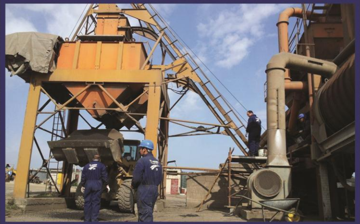
• utilizing existing plant facilities