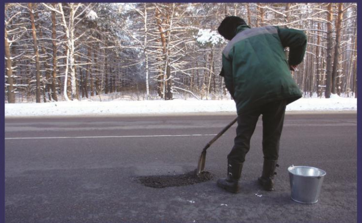
• sub-zero operations